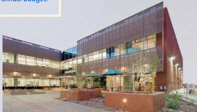
The first office was located in a rent-free downtown storefront owned by the county health department. The agency's administrative campus is based in midtown Phoenix. Four clinical office locations and 10 palliative care units are located across the Valley.

The first grant of $15,000 was received from the Flinn Foundation of Phoenix. Last year donations totaled $11.3 million.