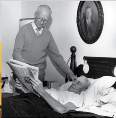
A few patients. 3,000 patients a day.