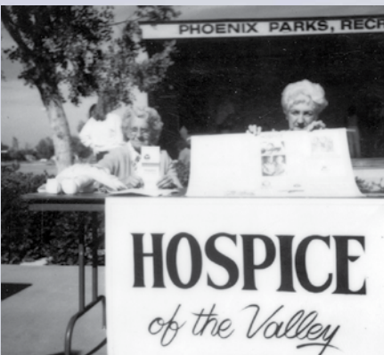
51 trained volunteers began serving in October 1978. More than 2,000 volunteers serve today.